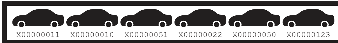
Figure 5: Cars parked in the parking area

The class Stack, which contains the Vehicle objects, has the following methods: